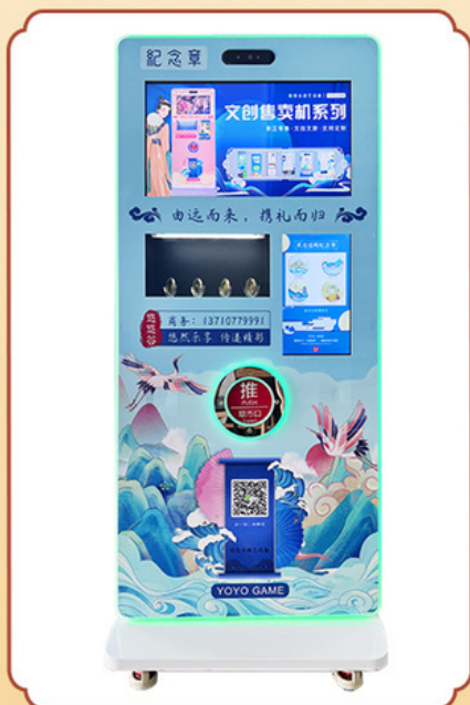
Dual screen model