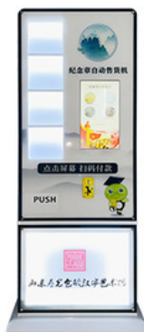
Dual screen model