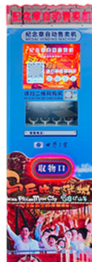
Dual screen model