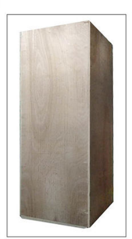
WOODEN FRAME PLYWOOD CASE

GAME Guangzhou Yoyo Game Amusement Equipment Co., Ltd.