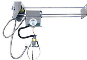
High quality overhead crane Controllable grip