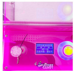
System settings menu Controllable parameters