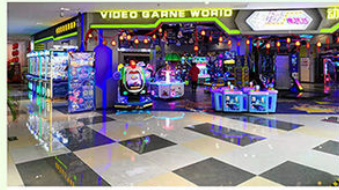
Arcade Game Center

Suitable for arcade game center, shopping malls, theme park, coffee shops, KTV, bars, cinemas, game room, restaurant, etc.