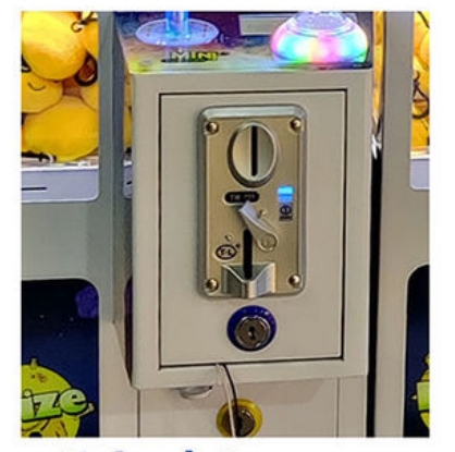
Coin acceptor special design for unti-EMI