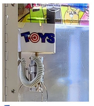
Crane Taiwan LCD motherboard crane